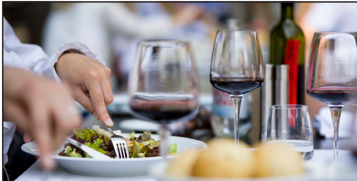
Section 2: Where to Dine