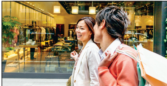
Section 4: Why Residents Love the Area