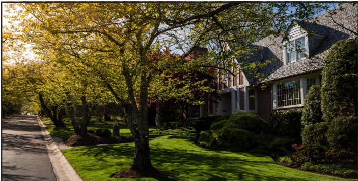
Section 1: Thinking About Moving to the Area?

In this guide, you'll get a general feel for the area—from Downtown Bethesda to North Bethesda and beyond. We'll highlight locals' favorite things to do in the neighborhoods from unique restaurant experiences, to shopping, outdoor activities, seasonal events, and more.