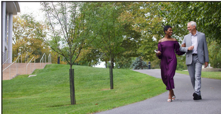
Section 3: What to Do